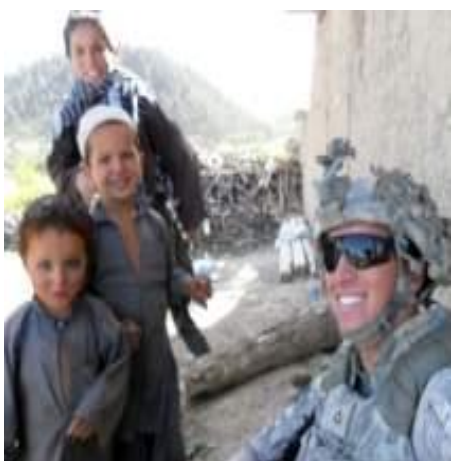
3rd PLT Soldier with local kids