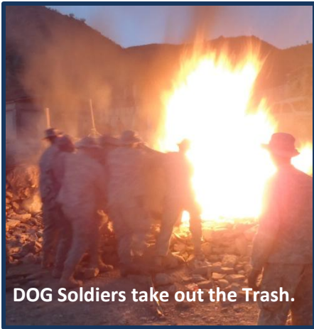
DOG Soldiers take out the Trash.