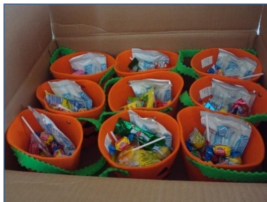
Halloween themed care packages that were sent to our White Currahee Soldiers