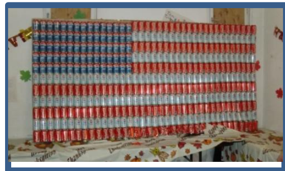
American Flag – Turkey Day Style @ COP Curry