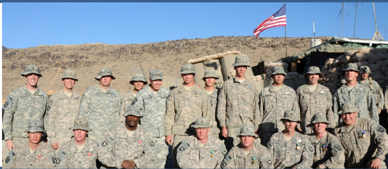
General Petraeus and the valor awardees at COP Margah

You should continue to be proud of Fox Company as we continue to work hard in one of the Battalion's largest area of operations. On the 25 th of November, we took a rare break to enjoy Thanksgiving Dinner with our Army family. Infantrymen worked through the night of the 24 th , along with our cooks, to ensure we'd feast on a delicious meal. Due to the outstanding actions and the disciplined work of Fox Company soldiers, we have plenty to be thankful for this holiday season.