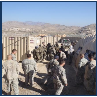
DOG Company and ANSF partners set up tents to help make time at the BCP livable through winter.