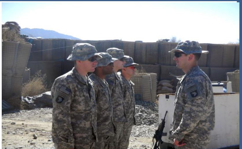
2nd PLT Easy Co promotes 4 Soldiers