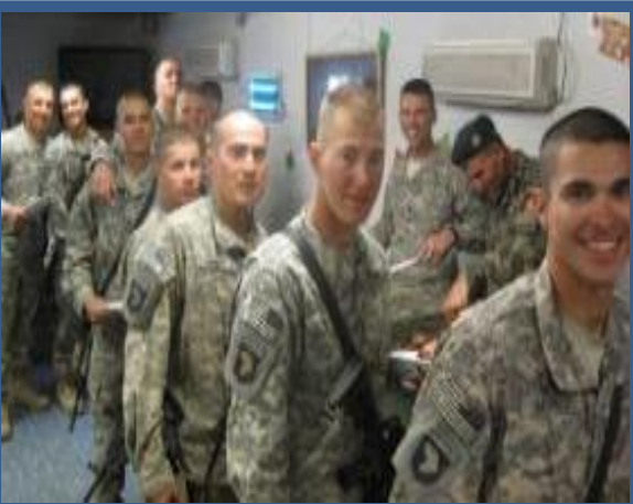
Fox Soldiers at FOB Boris getting Thanksgiving chow